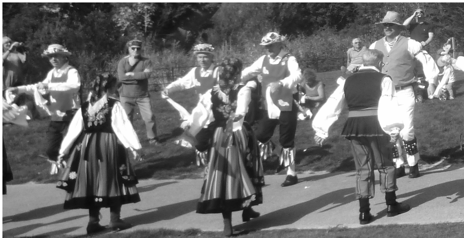
above: dancing Bonny Green Garters with the Morris sides

2015 was the third year of the Southdowns Folk Festival which takes place in Bognor Regis over the third weekend in September. With music, song and dance in the park and around the town, English folk takes precedence but International Folk Dance is represented by Bognor Regis International Dance Ensemble (my local group) and a couple of Appalachian dance groups. I am hoping that the international side will grow - but it's early days yet.